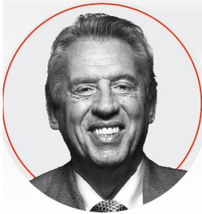
JOHN MAXWELL #1 Leadership Expert and Bestselling Author