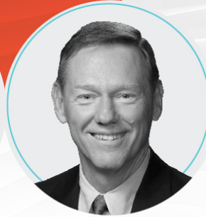
ALAN MULALLY Former CEO of Boeing Commercial Airplanes & Former CEO & President of Ford Motor Company