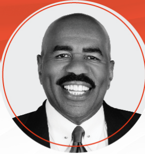
STEVE HARVEY Comedian, Businessman, Award-Winning Show Host and Entertainer